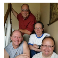
AMICI Sponsored by: MIKE ROSS, INC.