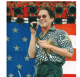
Gary Lewis & The Playboys