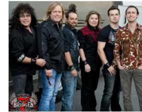
7 Bridges The Ultimate Eagles Experience