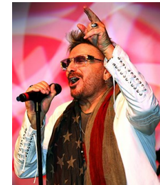
Chuck Negron Formerly of Three Dog Night