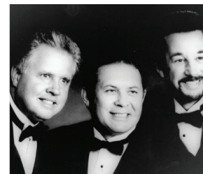
These Three Tenors