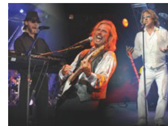
Stayin' Alive One Night of the Bee Gees